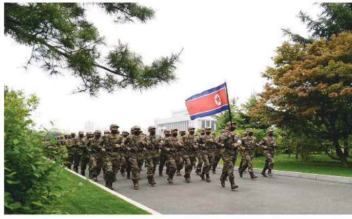
Combatants of the Korean People's Army Medical Corps dispatched to Pyongyang