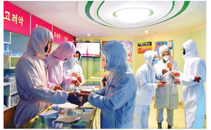
The medical staff of the KPA took direct charge of the supply of medicines to citizens.