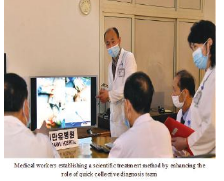
Medical workers establishing a scientific treatment method by enhancing the role of quick collective diagnosis team