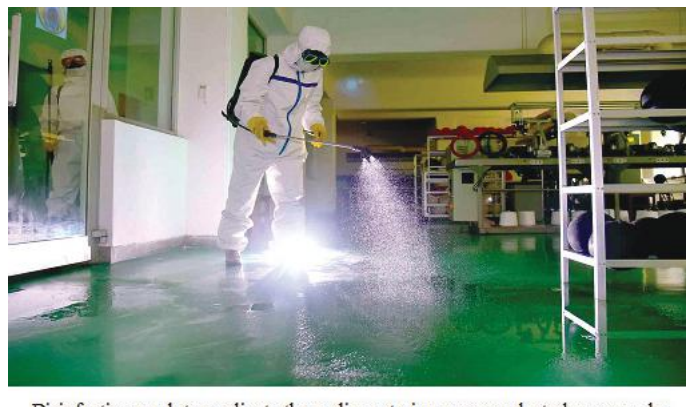
Disinfection work to eradicate the malignant virus was conducted on a regular basis.