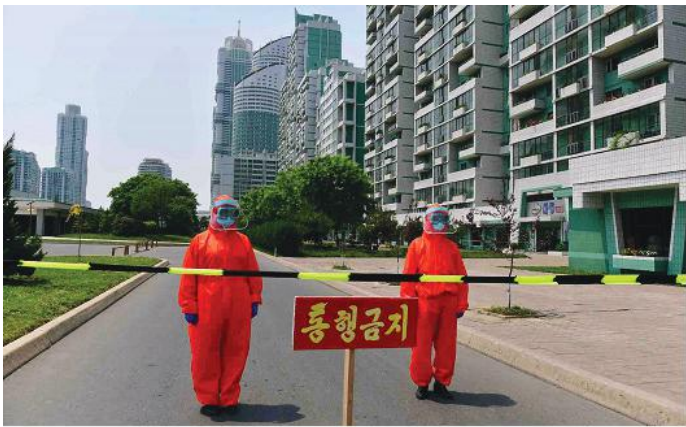
High-intensity blockade and tight closure were enforced all over the country.

In May 2022 the DPRK had to move to the highest-level emergency anti-epidemic system after the malignant virus had entered its territory. Kim Jong Un, General Secretary of the WPK, led the anti-epidemic war in the vanguard, dispatching the combatants of the army medical corps to Pyongyang and taking other necessary measures. Thanks to his leadership, the country was turned into a virus-free zone in only 90-odd days.