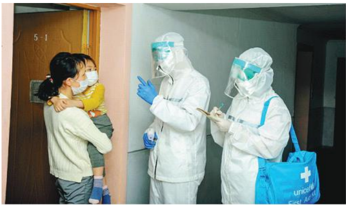
Medical workers conducting the screening and testing of the entire population