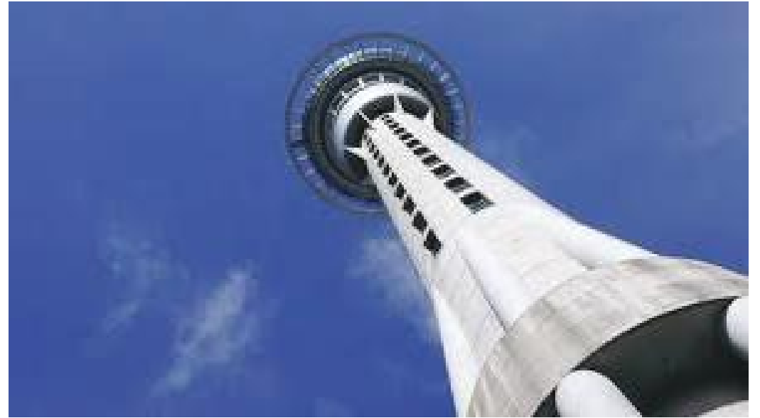
तलबाट हेर्दा टावर यस्तो देखिन्छ

यो टावर खासमा दूरसंचारको टावर रहेछ। तर अकलैन्ड शहर अवलोकन गर्ने टावरको रूपमा पनि यसको महत्व रहेछ। अकलैन्डका शहरको भिक्टोरिया रिस्ट्रटमा रहेको यो टावर दक्षिणी गोलार्द्धको अग्लो टावर मध्यमा पर्दोरहेछ र यसको उचाइ ३२८ मिटर अग्लो रहेछ। उसको उचाइ र डिजाइनको कारण पनि यो विश्वप्रख्यात भएको रहेछ। सन १९९४ मा यसको निर्माण