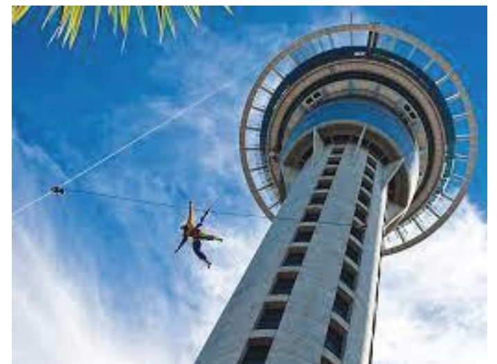
टावरबाट गरिने स्काइ वाकको दृश्य

यहाँ १८० मिटर, १९० मिटर र २२० मिटर गरी ३ वटा उचाइबाट दृश्यावलोकन गर्ने सुविधा रहेछ। २०० मिटरको दृश्यावलोकन कक्षबाट अकलैन्ड शहरदेखि ८२ किलोमिटर टाढासम्मको दृश्यवलोकन गर्न सकिंदो रहेछ। १९२ मिटरको उचाइमा भने स्काइ जम्प (वज्जी) र स्काइवाकका सुविधा रहेछन्। दूरसंचार, विश्वव्यापी