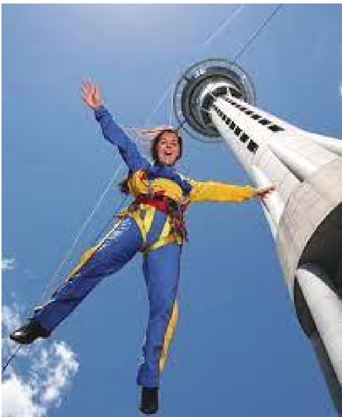
टावरबाट बज्जी जम्प गर्दै पर्यटकहरू