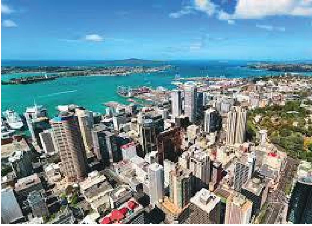
टावरको टुप्पाबाट देखिने अकलैन्ड नगर