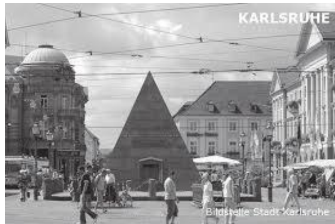
बजारको बीचमा रहेको पिरामिड