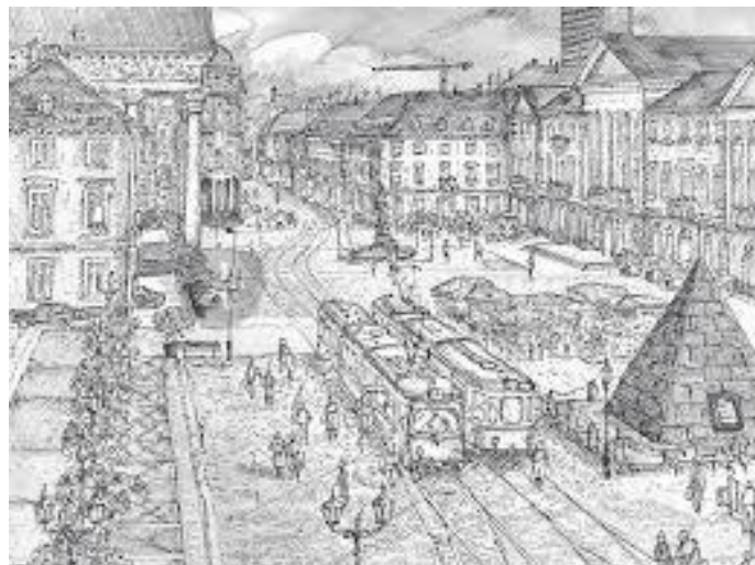
कार्ल्सरुहको भित्री सहरको प्राचीन तस्बिर यस्तो रहेछ

कार्ल्सरुहको दरवार परिसर, वनस्पती उद्यान र म्युजियम सबै हेरिसक्दा तीन घण्टा बितेको पत्तै भएन र तत्पश्चात हामी कार्ल्सरुहको पुरानो भित्री सहर अवलोकन गर्नेतर्फ लाग्यौं। यो भित्री सहर आफैमा एक पर्यटकीय स्थल रहेछ। पंखाको आकारमा डिजाइन गरिएको यो शहरको केन्द्र बिन्दुमा नै भित्री सहर अवस्थित रहेछ। यही नै सहरका संस्थापक मारग्रेभको चिहान पनि रहेछ।