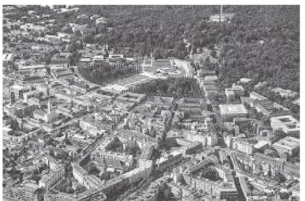
पंखा आकारको सहरको भित्री भाग माथिबाट हेर्दा यस्तो देखिन्छ

व्यापारिक र निजी प्रयोगका भवनहरूले घेरिएको रहेछ। यही फराकिलो स्थलको केन्द्र बिन्दुमा पिरामिड र दक्षिणमा ग्राण्ड ड्युकको शालिकसहितको फोहोरा देख्न पाईंदो रहेछ। यस स्ववायरको अर्को दर्शनीय स्थल भनेको प्रोटेस्टेन्ट गिर्जाघर (टाउनचर्च) रहेछ