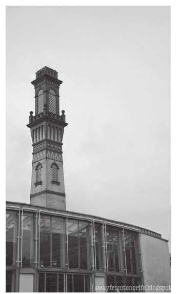
टावरसहितको गिर्जाघर यस्तो देखिन्छ