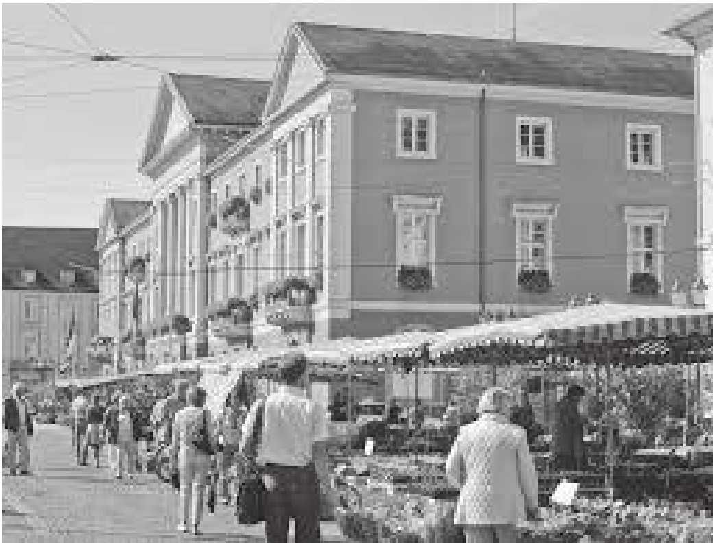
बजारको भित्री भागमा रहेको टाउन हल