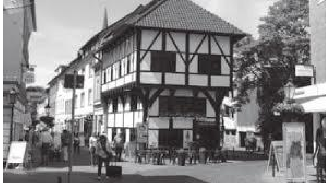
बजारको भित्री भागमा रहेको पुरानो वास्तुशैलीको घर