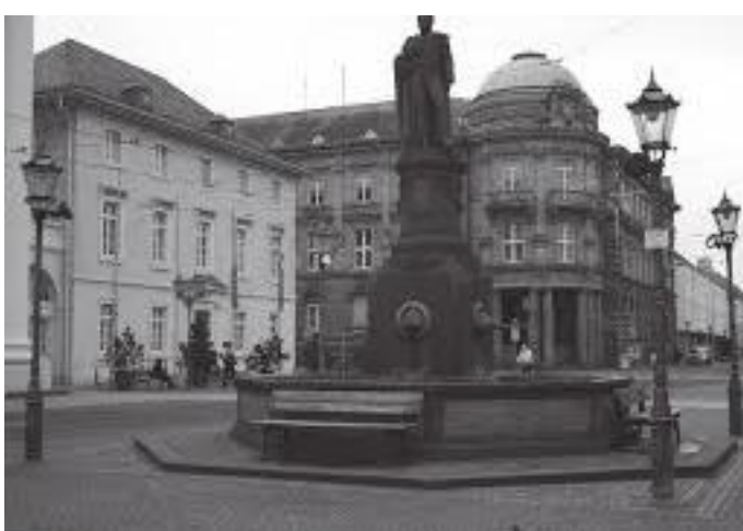
दरवार स्ववायरमा रहेको पानीको फोहोरासँगै लुडभिगको मूर्ति

बजारमा आइपुग्दा माथि भनिएका सबै दर्शनीय स्थलहरूसँग जम्काभेट हुँदो रहेछ।