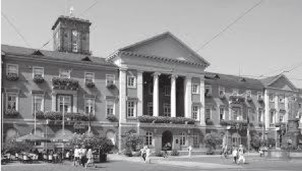
अगाडिबाट हेर्दा बजारको भित्री भाग यस्तो देखिन्छ